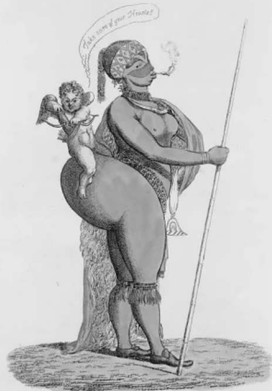
LOVE and BEAUTY -- SARTJEE the HOTTENTOT VENUS. 1855. Col. 44 by Currier & Ives, New York.

As Black girls and women attempt to navigate this narrow and damaging maze of tropes that dominate mainstream media, they encounter a funhouse mirror of sorts- barely recognizing the distorted images that stare back.